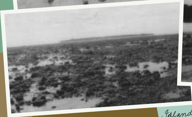
Island and reef